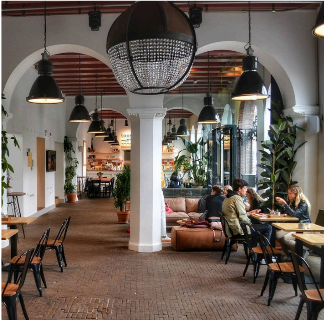
Cafe in Het Koorenhuis

Close to the Royal Palace and its extensive parks and gardens open to the public, there are also many restaurants and cafés in the vicinity.